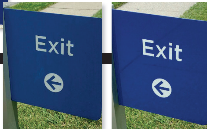
BEFORE & AFTER APPLICATION